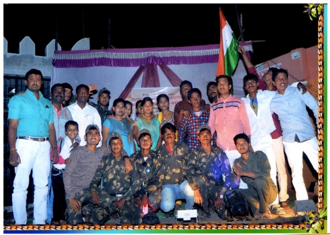
NSS Special Camp at Akolekati