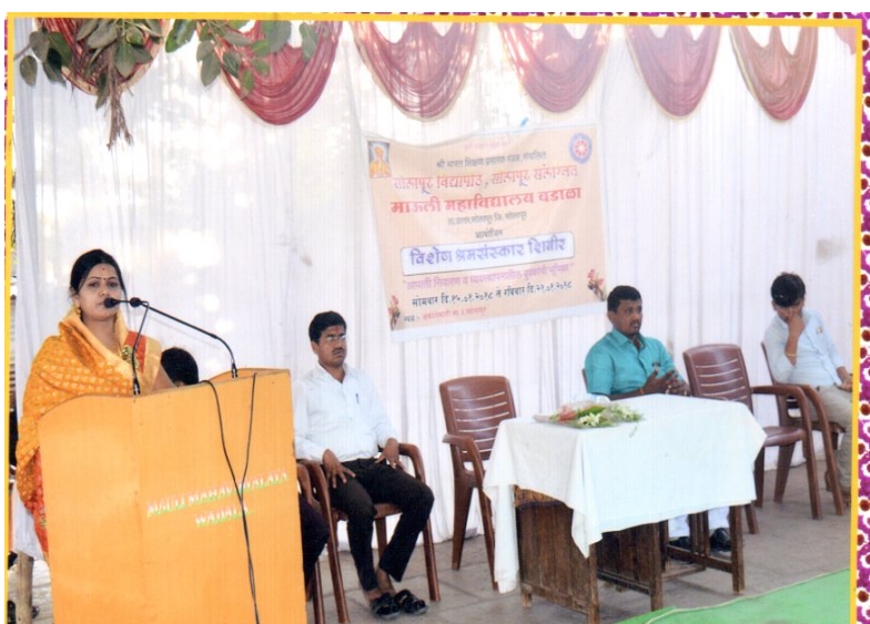
Lecturers in NSS Camp